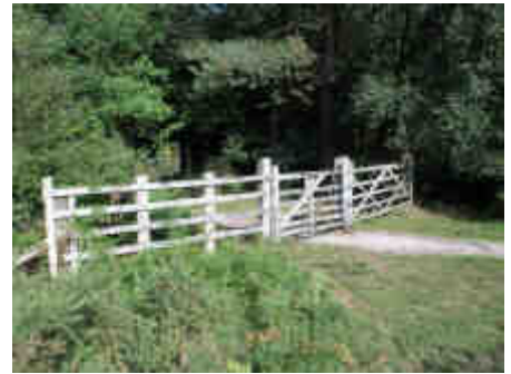
Typical gate arrangement for walkers and riders at Bramshott Chase

emergency vehicle access. Unauthorised vehicle access onto the common would not be permitted.