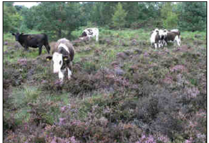
Commoners' cattle at Bramshott Chase