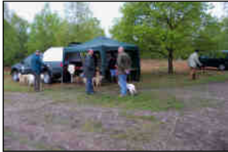
Consultation Road Show on Ludshott

D uring the spring, National Trust wardens and colleagues from the Ludshott Commons Committee have been undertaking consultations on the future long-term, sustainable management of Ludshott Common. The issues confronting the Trust are outlined in the previous three editions of Commons Link which should be read in conjunction with this article (they are still available to anyone who would like copies).