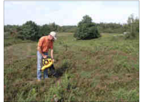
Sampling for mini-beasts using a specialised low-powered 'vacuum cleaner'