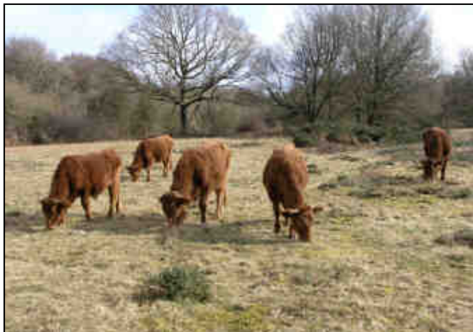
Cattle on Selborne Common