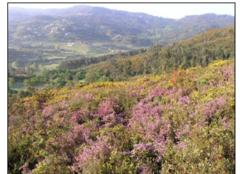
Hillsides of heathland in northern Portugal. This area near Cabeceiras de Basto was last grazed twenty years ago. A great deal of new housing is being built on abandoned common land.

There are still considerable areas of moorland and heathland commons (baldios) in northern Portugal. Most of the commoners have abandoned grazing these areas with their goats, sheep and cattle in the last fifty years. As a consequence there are now large areas of impenetrable scrub and many more severe wildfires.