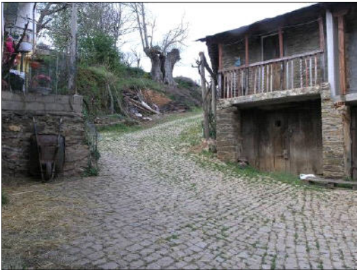
Left: Typical traditional accommodation for the family above and cattle below, in the village of Rio de Onor on the Portuguese-Spanish border.

people have to work hard in these landscapes and it becomes more apparent each time I visit these special places, that we do too if we are to conserve our remaining wild areas.