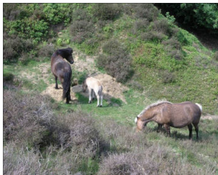
Icelandic ponies grazing heathland at the Veluwezoom National Park

Although densely populated, Holland has developed some bold and dynamic conservation projects to preserve their remaining natural areas. Where extensive tracts of heathland in the centre of the country, such as the Veluwezoom National Park, have been set aside as nature reserves, habitats are maintained using old breeds of cattle and horses, which are allowed to interact naturally with the environment in ways very similar to their wild primeval forebears.