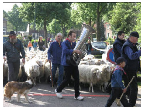
The village of Leonen north of Arnhem has established a popular sheep festival when their 'heideschaap' (heath sheep) are gathered for shearing. The sheep follow the 'oompah' band through the village to the festival.

On other heaths and common land grazing with sheep has only recently ceased. The local communities have realised how important the old traditions of livestock keeping and shepherding are for their rural identity and landscape.