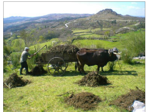
Right: At the end of the winter the soiled bedding is used as manure on the village fields, pastures and meadows. Very rarely today will you see the manure being transported in traditional boat shaped ox carts. I was lucky to chance upon this scene in the Alvao National Park, Portugal.